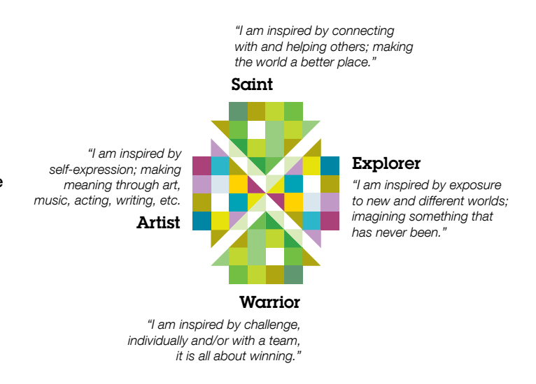
Figure 4: IBM's sources of creative energy model - four archetypes.

Breakthrough results are often rendered by a tightly integrated team, co-located to promote maximum connectivity on multiple levels (in work and non-work situations), and yet augmented by extended relationships. When asked about the kinds of people they would choose for a small "mission-critical" creative team, our study participants prioritized diversity in perspectives and sources of creative energy above all. They agreed that team differentiation – having many distinctive parts – is more likely to lead to an original and valuable solution.