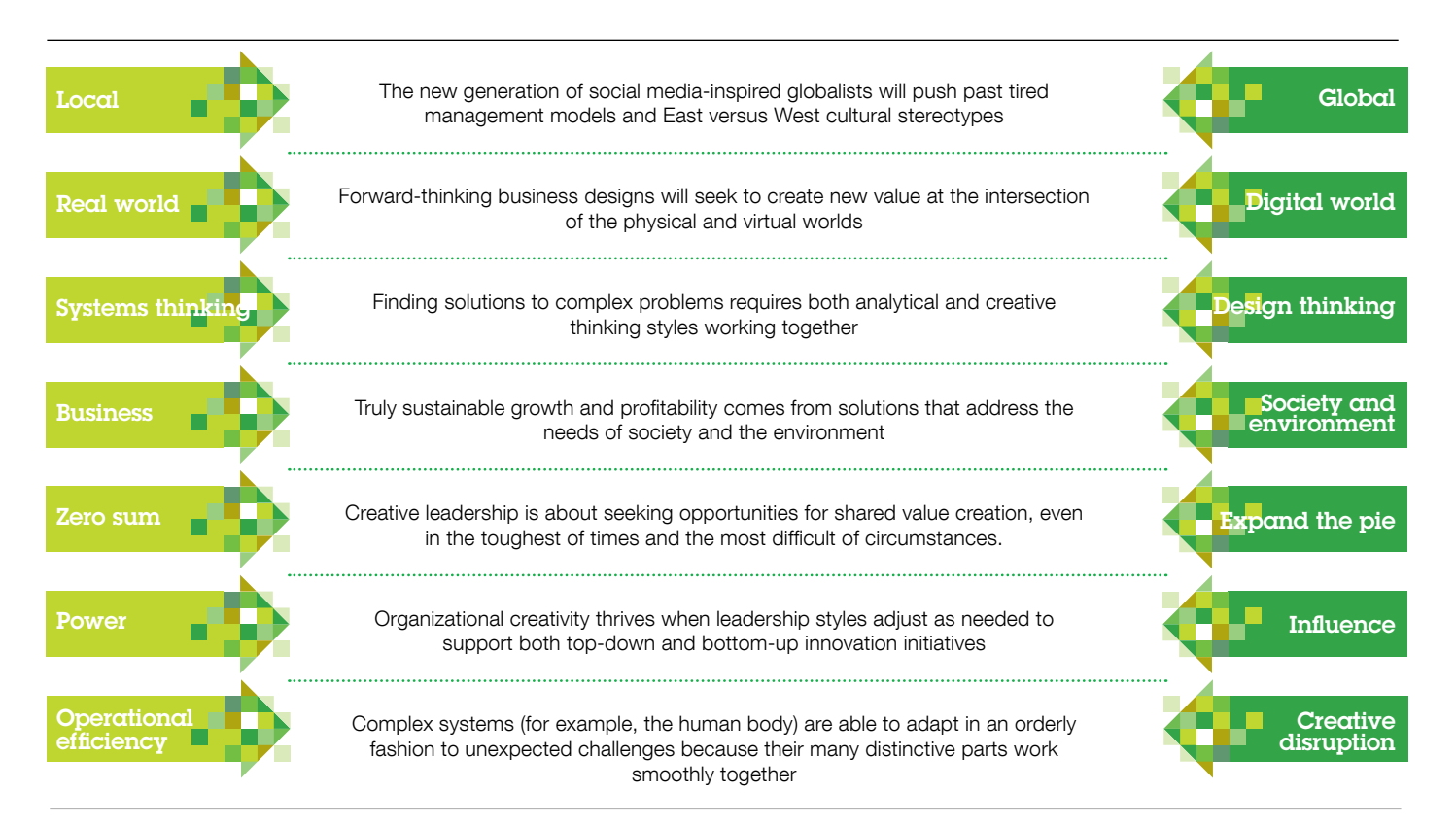
Figure 2: By harnessing the energy of opposites, creative leaders and their organizations can benefit from new assumptions that replace less effective "either/or" approaches.

Our IBM Creative Leadership Study found that to succeed in an increasingly interconnected world, creative leaders avoid choosing between unacceptable alternatives. Instead, they use the power inherent in these dualities to invent new assumptions and create new models geared to an ever-changing world (see Figure 2).